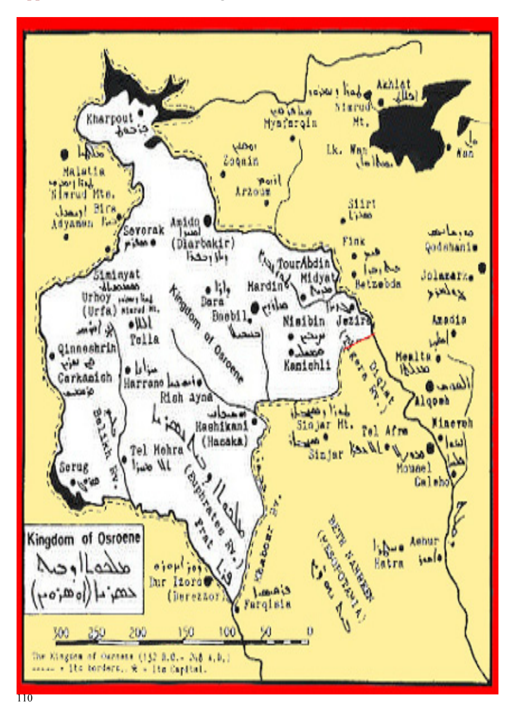
Appendix 4- Edessa and the Kingdom of Osrhoene

<sup>110</sup> Assyrian Kingdom of Osroene.