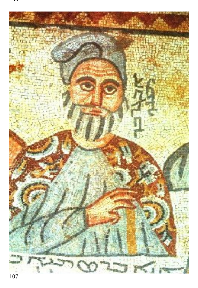
Appendix 1 - Abgar Bar Ma'nu mosaic from Urfa

<a href="http://www.skepticalspectacle.com/images/abgar.jpg">http://www.skepticalspectacle.com/images/abgar.jpg</a> (accessed February 10th, 2006).